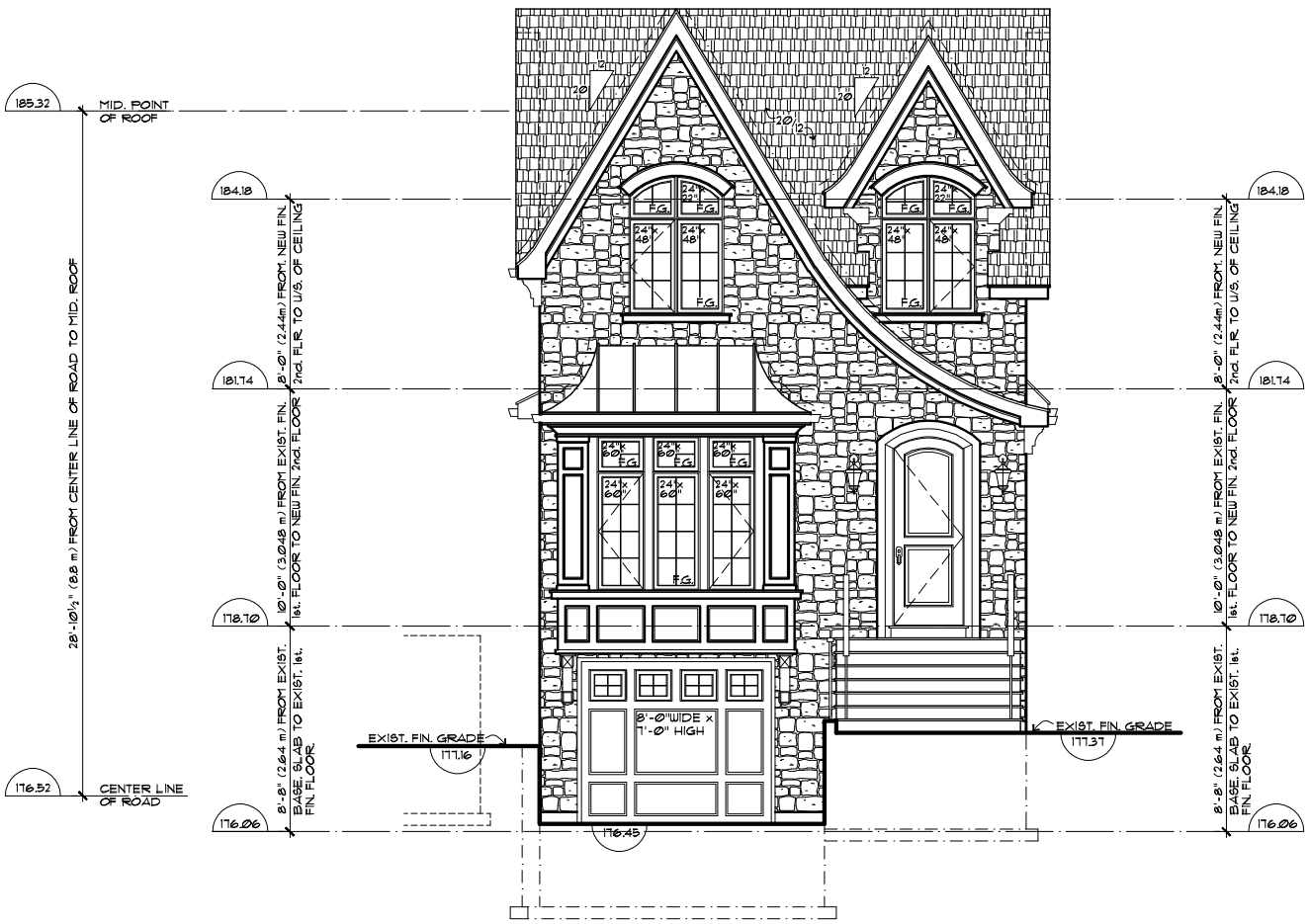
FRONT NORTH ELEVATION